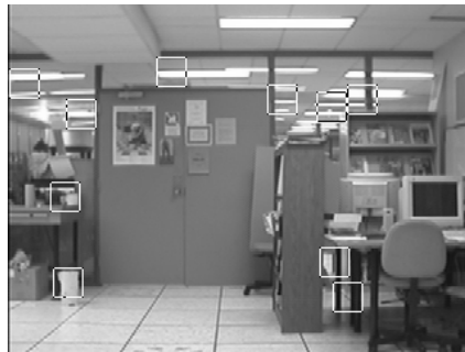
Figure 1: Detected Candidate Landmarks in an Image.

Luminance edges appear to encode much of the relevant geometric content in images, yet edge operators suffer from instability due to sensor noise or variations in lighting conditions. Ideally one might wish