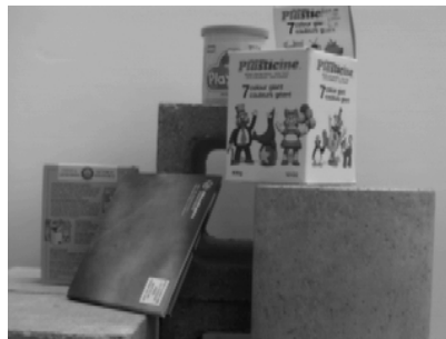
Figure 3: The test environment.